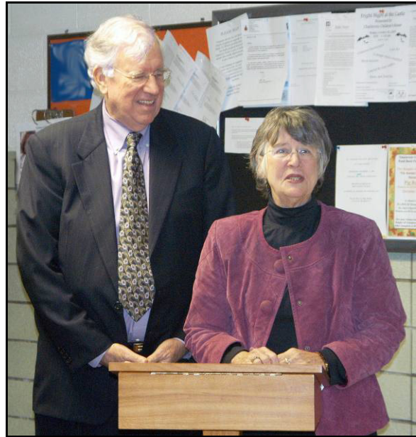
Benjamin Gohs/Charlevoix Courier