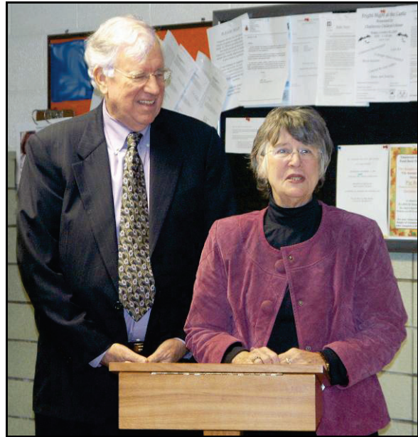
Benjamin Gohs/Charlevoix Courier